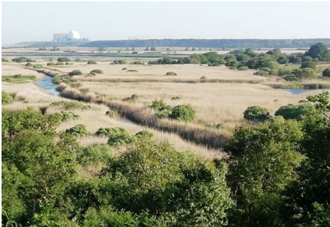
Above is the view across Minsmere RSPB reserve, from the National Trust owned Dunwich Heath.

This whole area is a precious resource, not just for nature, but also for human recreation. It is an increasingly popular holiday and visitor destination. Jobs, which seems to be a main argument for this development, should be in tourism and hospitality. Farmers are diversifying by setting up campsites and building holiday lodges, to