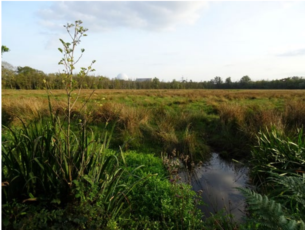
Above is the view across protected Sizewell Marshes looking towards the power stations.